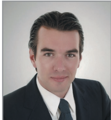
Guillaume Maurice Scotia Capital Inc. ScotiaMcLeod